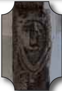
Jack In the Green