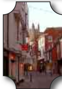
St Margaret's St